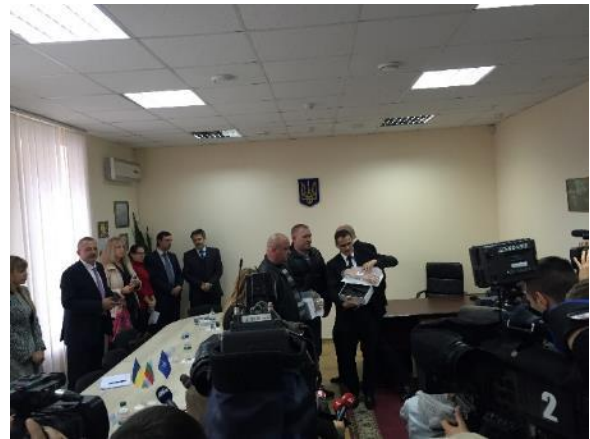
Official ceremony in State Service Veterans of War of Ukraine