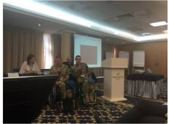
USAID international conference dedicated to the topic “Role of Physical therapy in the health system”