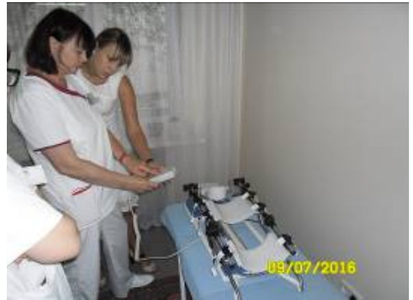
Ukrainian State Medical & Social Centre for War Veterans village of Tsybli (MOH)