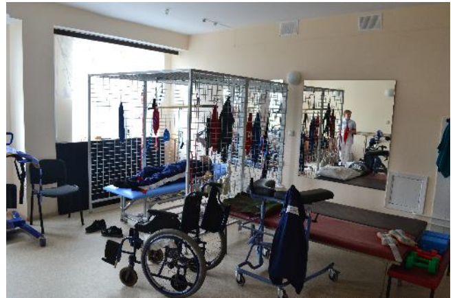
Hospital of Veterans of War “Puscha Voditsa” (MOH)