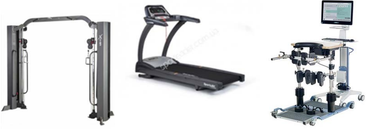
Example of equipment being procured for Lviv Military Hospital

3.2.5 Additional third (and last) Work Package of Recreation and rehabilitation equipment for a total value 33,257.60 EUR has been agreed on. Procurement has started and equipment delivery and installation is planned by the mid of December 2016.