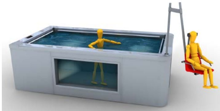
Example of MEP with Lift