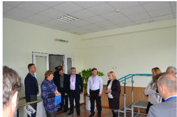
International Conference on Prosthetist and Orthotist Education in Ukraine