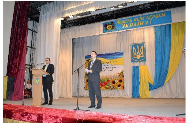
Official ceremony of handing over the modern medical rehabilitation equipment to the Ukrainian State Medical and Social Center for Veterans of War in Tsybli village of Kyiv oblast.