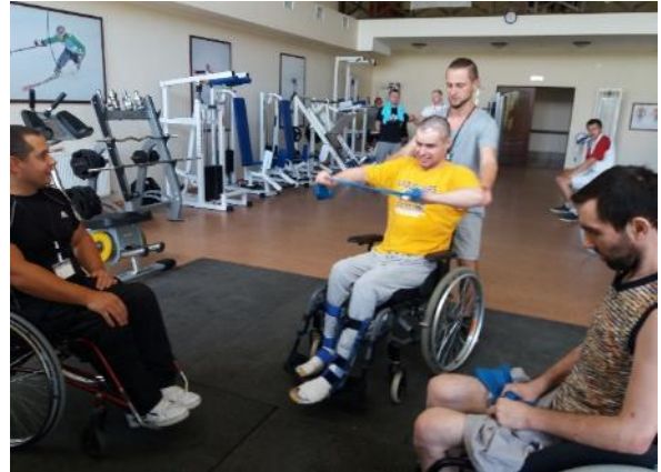
First sport camp entitled “Back to Life” for ATO participants on the base of Wester rehabilitation sport center 27 July-7 August 2016

2.4.6 On 09 August 2016, PS together with Chief of NSPA office in Ukraine (CO) visited Ukrainian State Medical & Social Centre for War Veterans village of Tsybli (MOH) to confirm that all rehabilitation equipment in accordance with PO -4500333902 center, was received in appropriate condition.