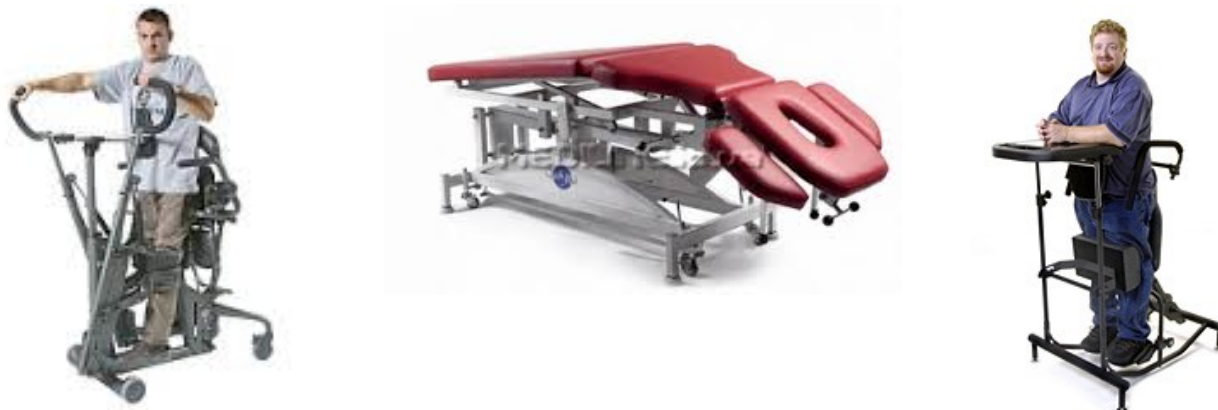
Examples of equipment being thought