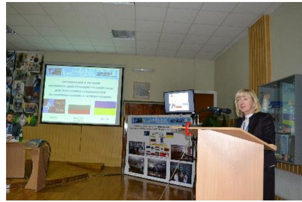
The International Medical Conference on Prosthetist and Orthotist Education in Ukraine in Research Institute for Prosthetics, Prosthetic Design and Rehabilitation, Kharkiv

3.2.14 A summary of supported training and educational events since project start is provided in the following table. Categories include Mental Health (MH), Physio-Therapist (PT) and Prosthetists/Orthotists (P/O). There were 2 events sponsored during the period for a total of 18.