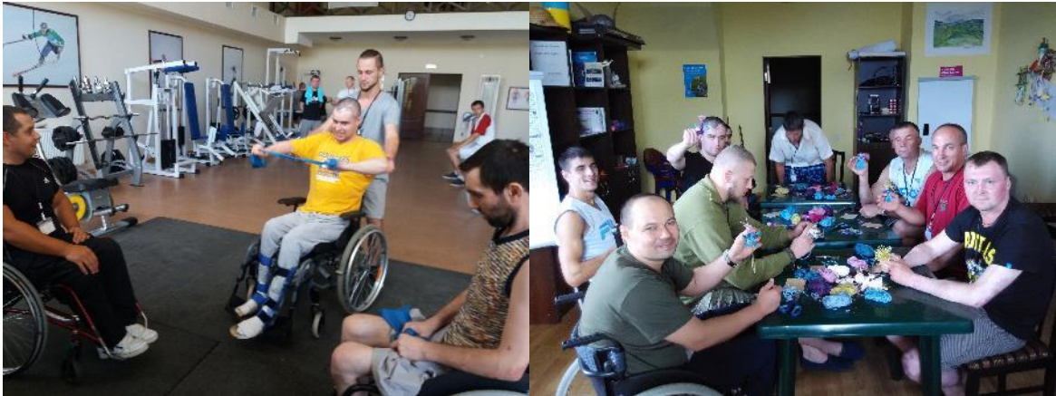
First\pilot sport camps “Back to Life”

3.1.8 From 27 July-7 August 2016, the first/pilot rehabilitation sport camp with focus on ATO members with spinal trauma/injuries was held. It included 4 participants in wheelchairs (1 with damage to the spinal cord (lower spastic paraplegia), 2 with quadriplegia and cognitive impairment due to cranial injury, 1 with amputation). Other participants (have damage to the musculoskeletal system of varying severity and consequences of concussion).