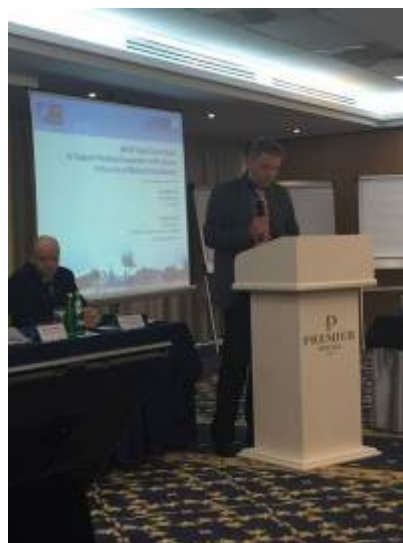
USAID international conference dedicated to the topic “Role of Physical therapy in the health system”

3.2.12 From 01 October to 02 December 2016, three Ukrainian specialists will attend two-months training for “physical therapists/specialists of physical rehabilitation” at the Rehabilitation Clinic of East Tallinn Central Hospital and Tallinn Health Care College (Tallinn, Estonia). All specialists have qualification of “physical therapy/specialist of physical rehabilitation”. Their participation is funded both by Estonia and the NATO Trust Fund.