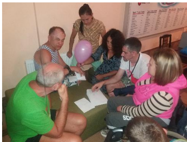
Third sport camps "Back to Life"