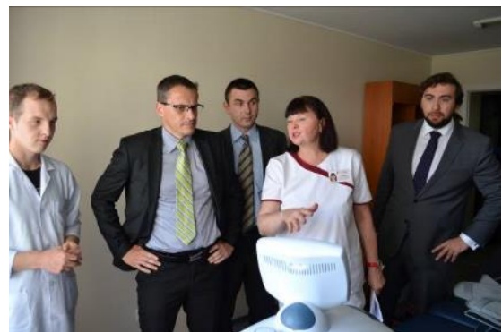
Official ceremony of handing over the modern medical rehabilitation equipment to the Ukrainian State Medical and Social Center for Veterans of War in Tsybli village of Kyiv oblast.