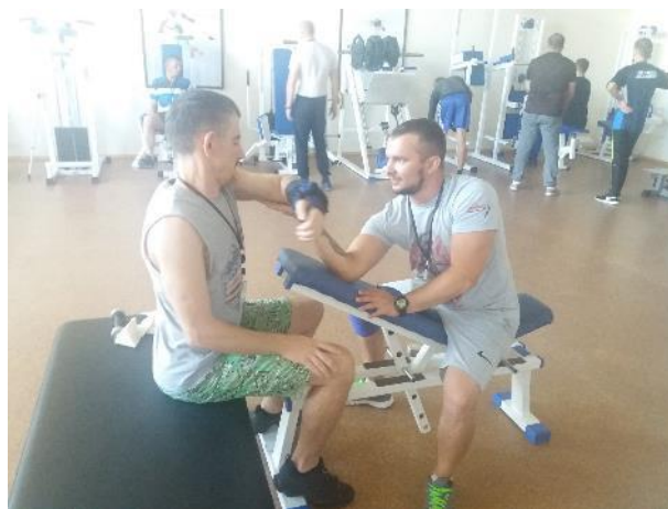
Second sport camps "Back to Life"

3.1.9 On 9-20 September 2016, the third rehabilitation sport camp was held. The outside "Evening Carpathian legends" by the fire was found as a very positive moment. It helped creating a team spirit, becoming friends with each other and with instructors, easing communication and building trusted relationships. The organizers decided to continue with this practice as an ice breaker to the participants.