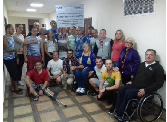
Second sport camp entitled “Back to Life” for ATO participants on the base of Wester rehabilitation sport center 16-27 August 2016