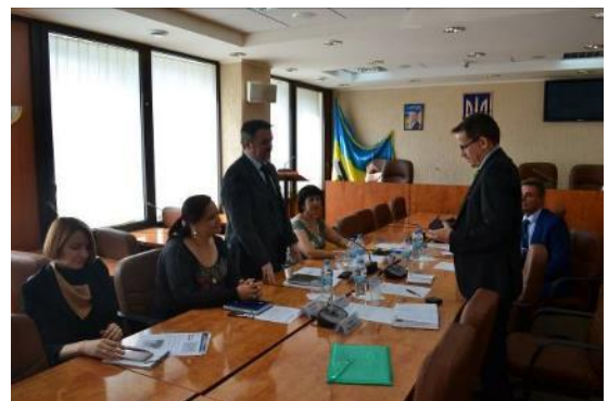
Meeting in the Ministry of Social Policy